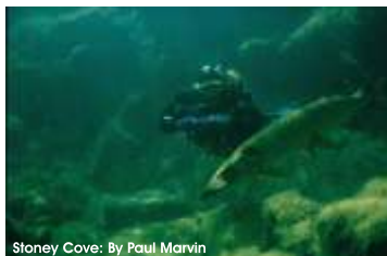
Stoney Cove