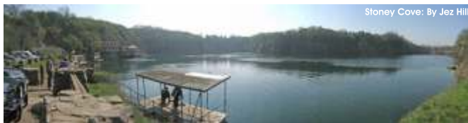
Stoney Cove